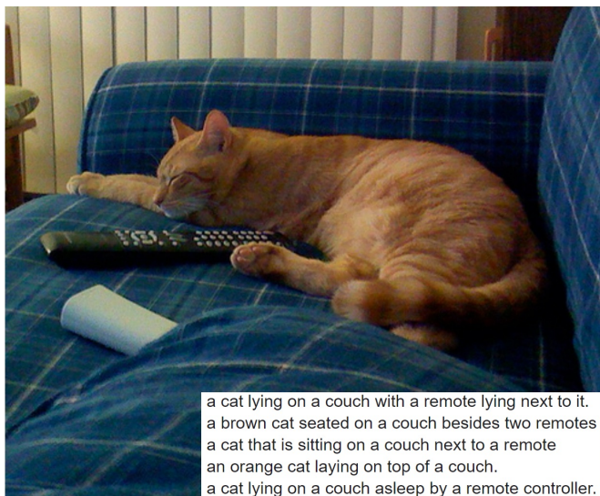
Figure 1 An example of image-caption from MSCOCO dataset

In any case, the training of these neural architectures requires large scale collections of multimedia content paired with one or more captions. Important (and costly) effort led to the production of several datasets, most of which exist only for English. Examples are the MS-COCO dataset (Lin et al. 2014) for image captioning, made of 600,000 captions for about 120,000 images and the MSR-VTT dataset (Xu et al. 2016) for video captioning, made of 200,000 captions for 10,000 videos. Figure 1 reports an example from the MS-COCO dataset, i.e. an image with the corresponding five captions.