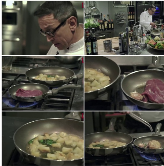
Un uomo sta cucinando il cibo in una padella